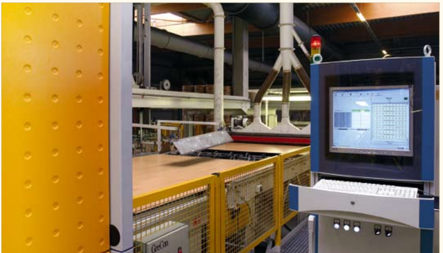
SUPERSCAN in production line